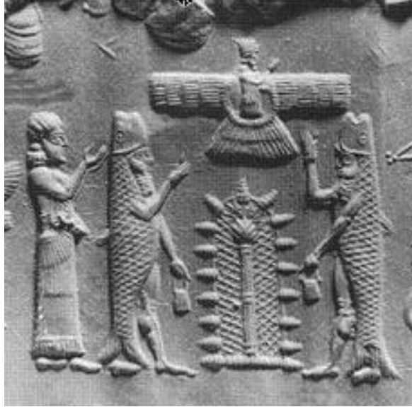
Priests of E.A., wearing fish suits tend his i pillar.

E.A. led the Anunnaki in search of the “blue stones that cause ill,” meaning illumination, luminescence, enlightenment . He found them at a place called Arili (Ireland?). Sumerian myth romanticized by Zecharia Sitchin says Enki was a genetic scientist who came from the mysterious, and presently controversial, Planet X.