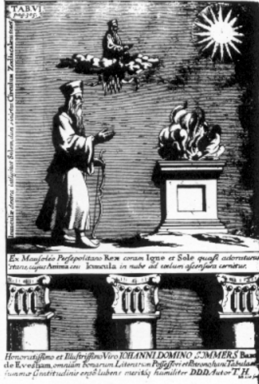
Ahura Mazda floating on a cloud above an Ark- like box.

This deduction that E.A. is the God of light of the Ark brings up another. There were two teachings of Moses. The first is the blue stone-based enlightenment teaching of E.A. The second, the Ten Commandments, a penal code for the Israelite slaves, is Enlil's, whose editors removed the mention of the enlightening blue stones from the biblical story.