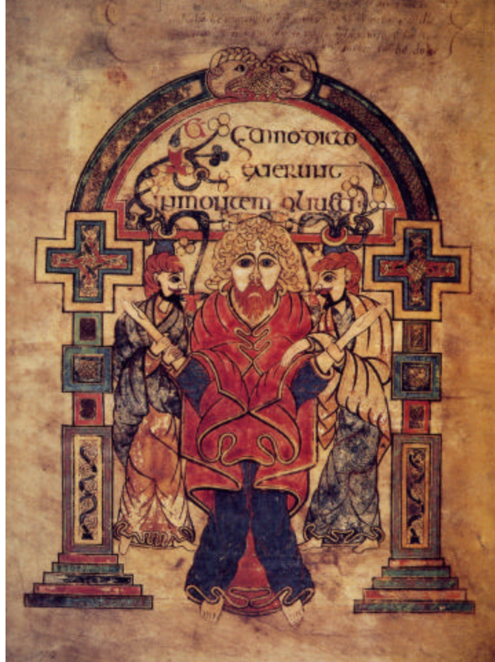
Jesus (called Pan-Tara, 'god of Tara') is known in ancient Irish history as Iessa, a name derived from I.A. or E.A. His arrest, shown in the Irish Book of Kells, features the three orbs.