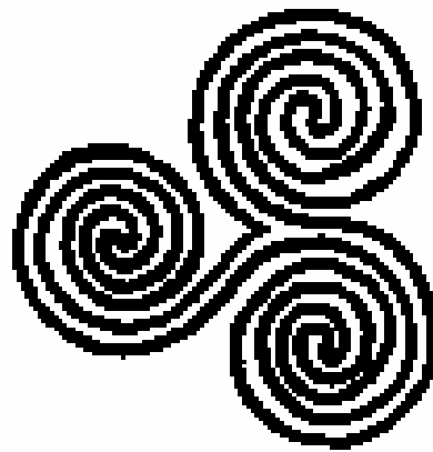
The three orbs appear as the triple spiral in Ireland.

That's why light burned through my veins as I shuttled between Sumerian, Irish and Cathar histories, pouring over currents of symbols and myths that criss-crossed these cultures.